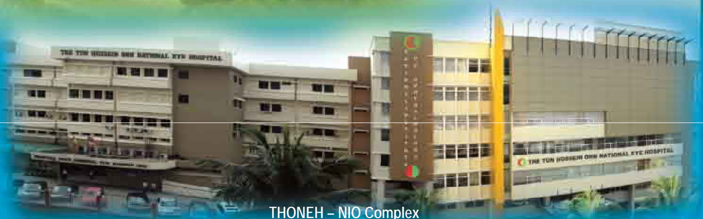
THONEH - NIO Complex