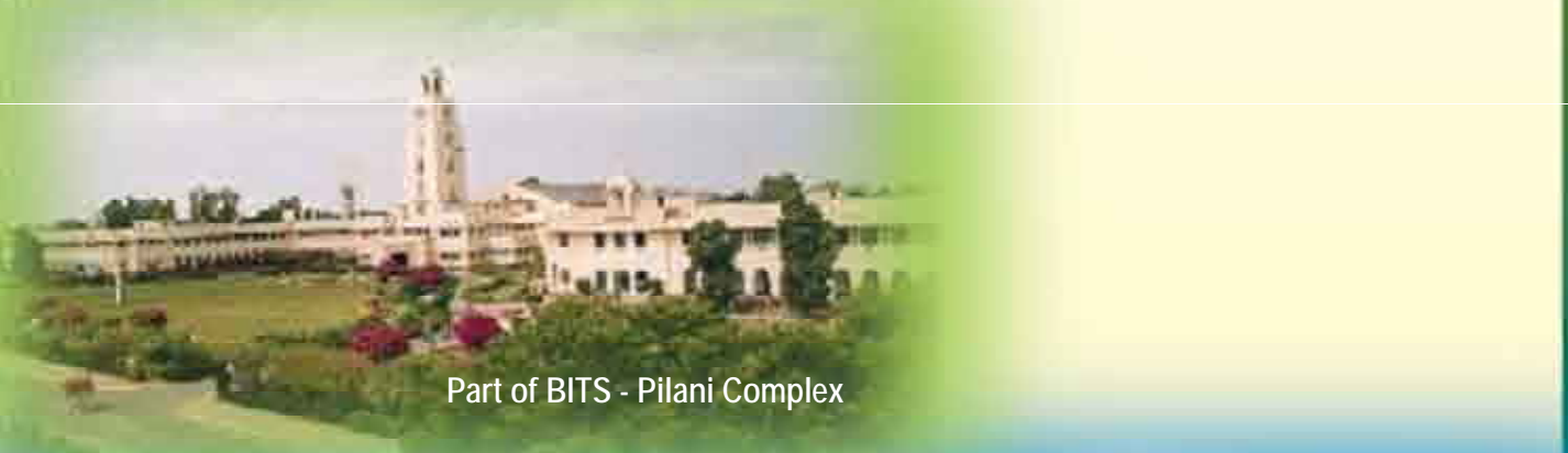
Part of BITS - Pilani Complex

The only eye hospital based Optometry Degree Programme with direct patient care in Malaysia.